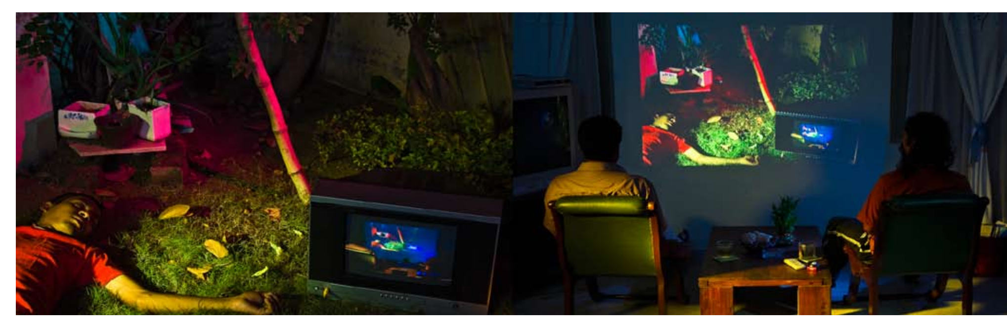
Deja VU, inkjet print on archival ilford fibre silk paper, 16" x 48", edition 1/4, 2011

the twin imperatives of duty and necessity (to bury or cremate the war dead as they lie festering all over the beautiful Burmese countryside, which quickly turns into an obsession), he decides to stay on. At a fundamental semantic level, this is a clear illustration of the Lacanian deathdrive, - the compulsion, which comes from an other place, that makes us do things that have no rational significance. But the greatness of the film also lies in the way in which it sets up a relay between silence and an entire complex of other signifiers (death, patriotism, honour, duty and friendship, among others). In the film, the Real is the naked horror of the war itself, which renders the protagonist mute<sup>4</sup> in the face of the meaningless suffering that he sees etched into the very face of the landscape. But like Antigone<sup>5</sup>, in assuming a position that is neither dictated by self-interest nor by altruism, but which still does not originate in the wounded conscience and goes as well beyond the call of the Big Other<sup>6</sup>, and which thereby radically reworks every