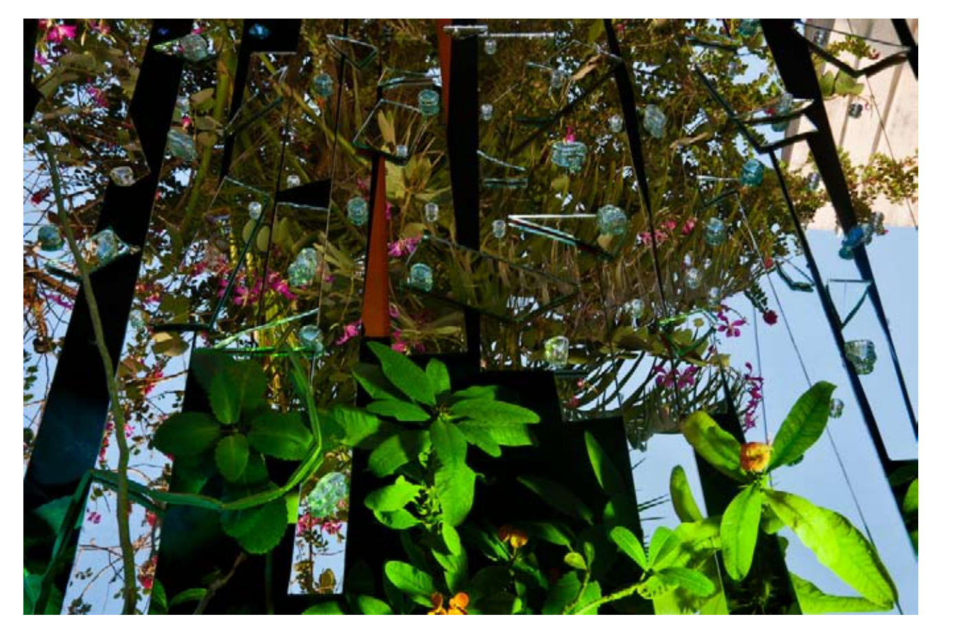
Satori, inkjet print on archival ilford fibre silk paper, 28" x 42", edition 1/4, 2011