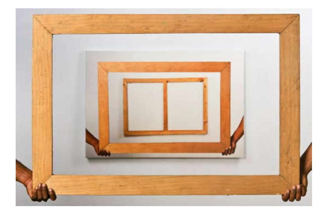
Tabula Rasa, inkjet print on archival ilford fibre silk paper, 28" x 42", edition 1/4, 2012